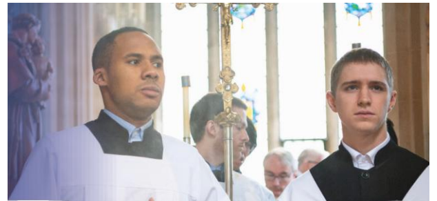
SEMINARIANS IN TRAINING – PRAY FOR THEM

Please do come and join this weekly gathering which meditates on the forthcoming Sunday Gospel. Starts Wednesday 29 April. 8 pm. Sacristy behind the Sanctuary.